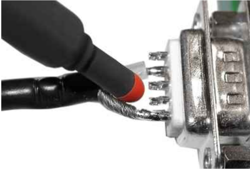
Application BS 04DB