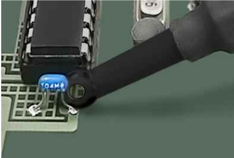
Application BS 05D