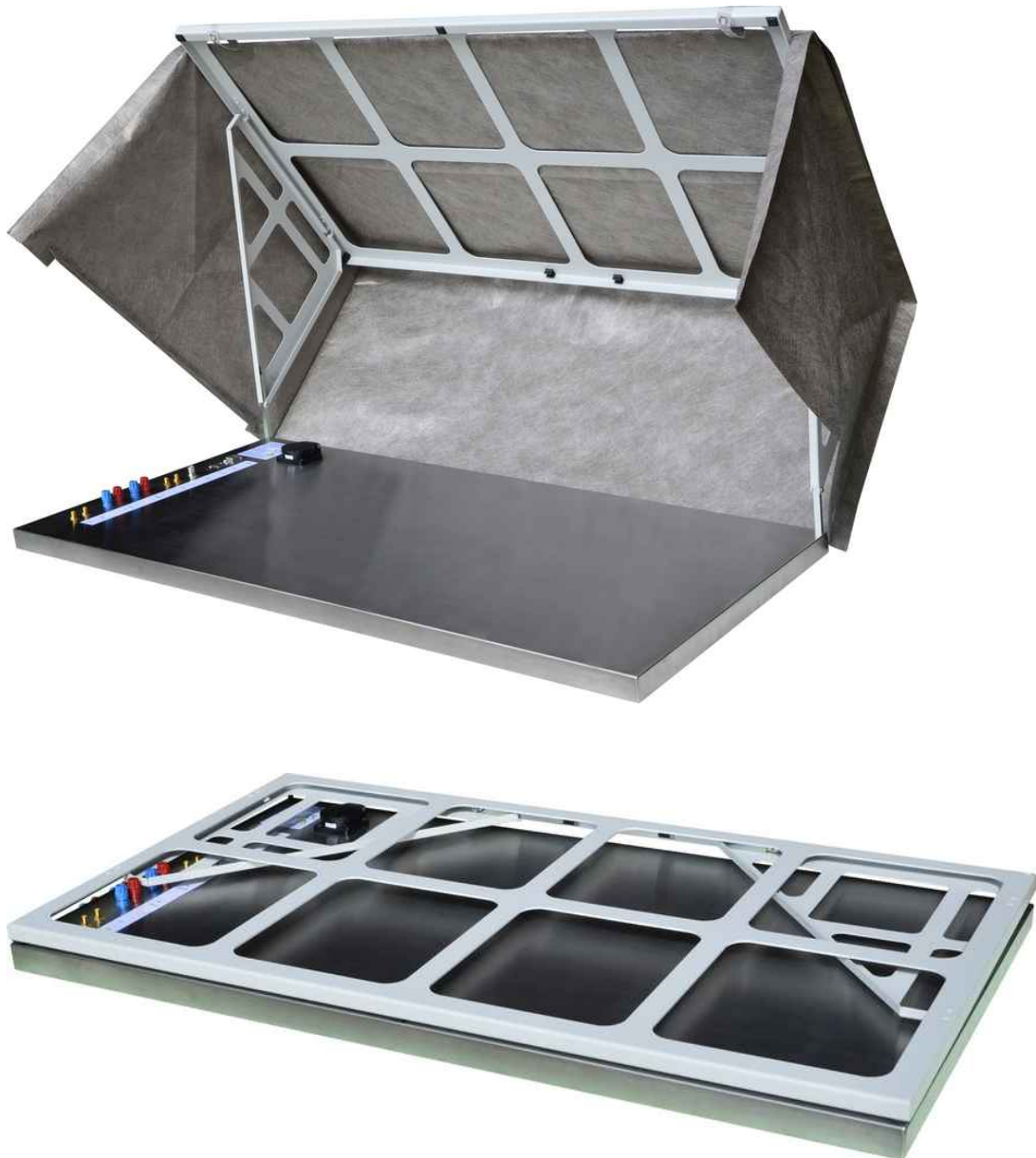
Opened shielding tent